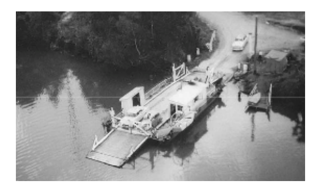
Wardell Ferry on Northern approach c 1960