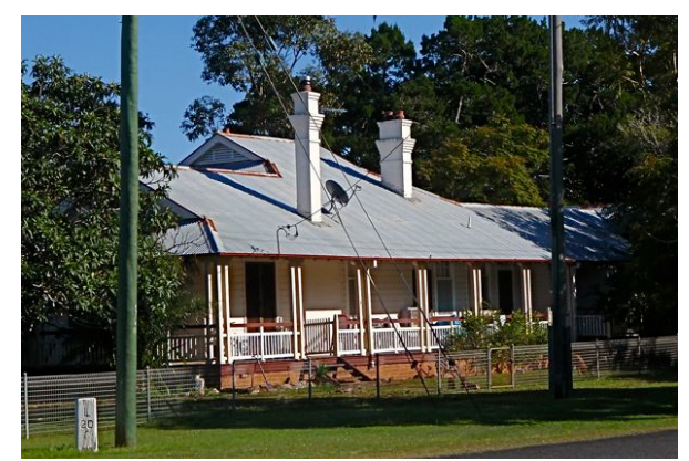
Wardell Police Station.