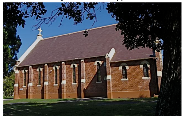
St Patrick's Church centenary 13 Nov 2010.