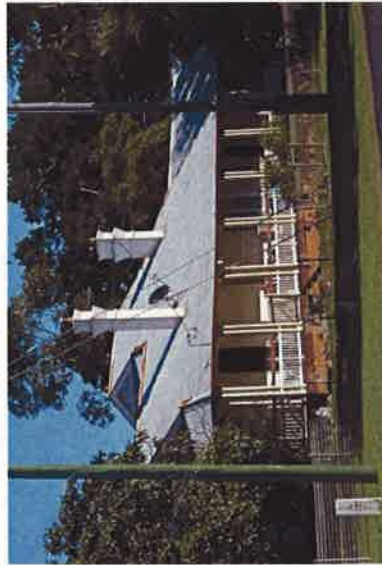
Wardell Police Station.