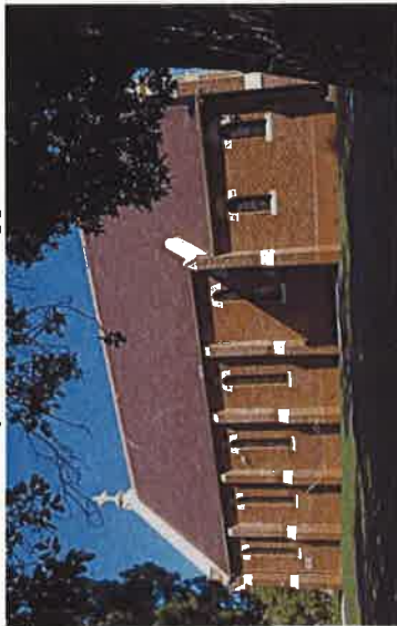
St Patrick's Church centenary 13 Nov 2010.